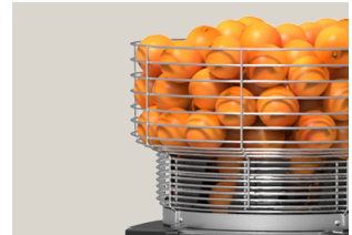
Basket in two sizes

The machine includes a 9-kilo capacity basket as standard equipment. In those cases when an increase in the juicer's autonomy is required, there is an optional basket with load capacity of up to 16 kilos of fruit.