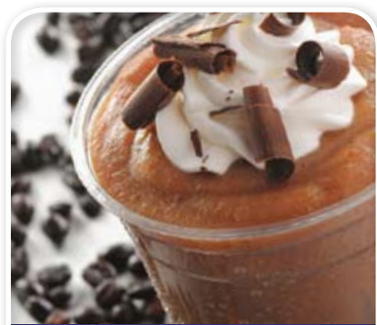
Creamy, blended coffee drinks