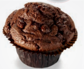
Reheated Muffin 30 sec.