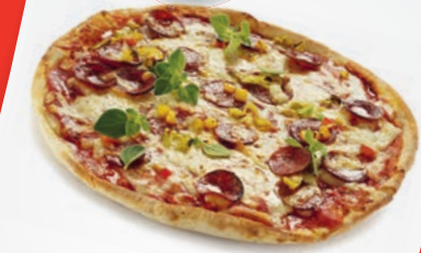
Pizza 50 sec.