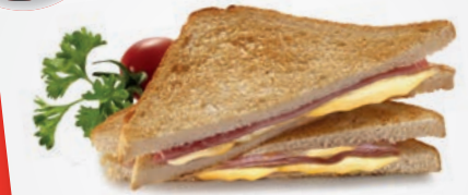
Toasted Sandwich 40 sec.