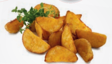
Wedges 60 sec.