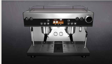
Two integrated grinders