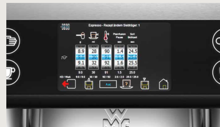
Extensive software settings via touch display