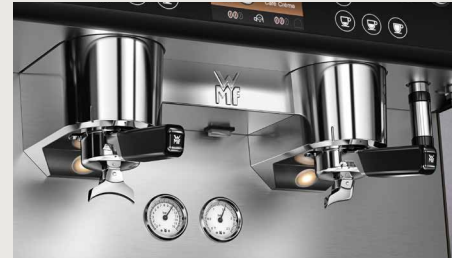
Automatic portafilter identification (single/double cup)