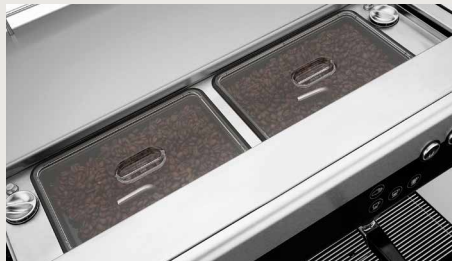
Two air cooled bean hoppers for different types of coffee beans (Espresso and Café Crème)