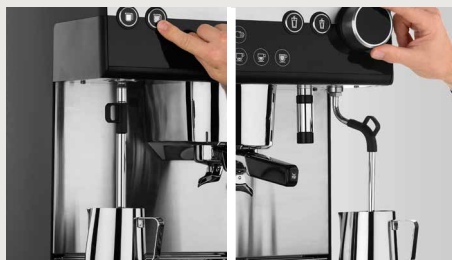
Milk foam preparation (fully-automatic using the manual steam wand)