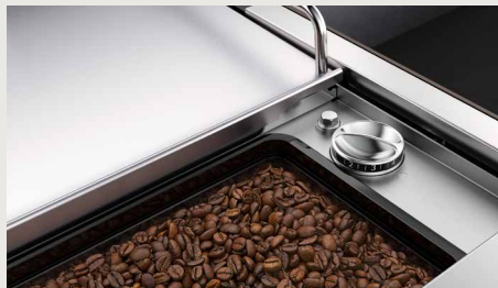
Brew time monitoring with software-assisted grinding degree setting