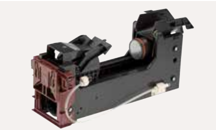
Professional brewer A true pro that guarantees a long service life and peak performance.