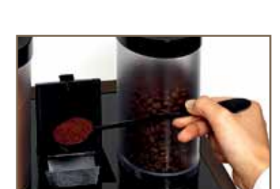
Manual insert It is possible to use other types of coffee, e.g. decaffeinated coffee, by using the manual insert.