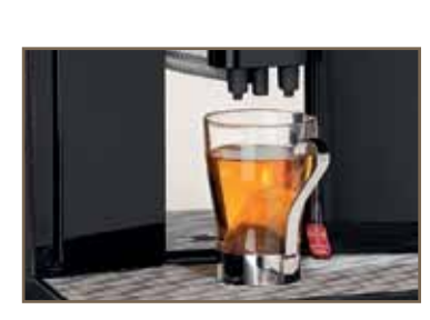
Hot water at the perfect temperature produced by the WMF 1200 S, for example for tea, at the press of a button, of course.