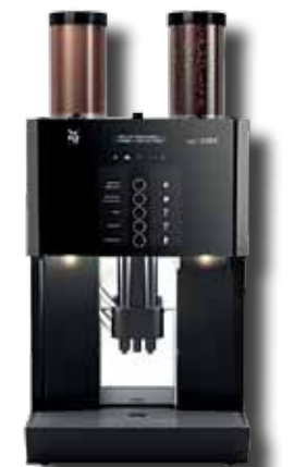
Equipped with one grinder and a Choc container