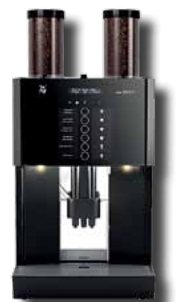
Equipped with two grinders