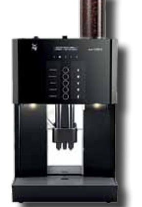
Equipped with one grinder