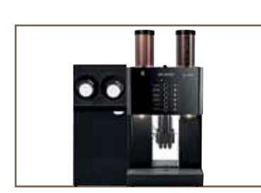
such as cupboard, milk cooler, one-price WMF 1200 S a team player – even for

professional@wmf.de \cdot www.wmf.com 3074 # 63 3038 0391 Printed in Germany 03.12