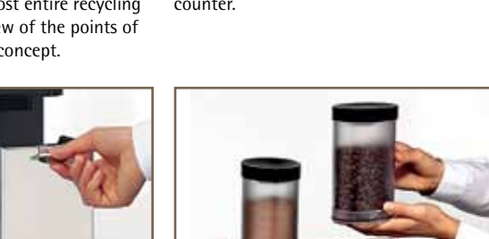
Large ground coffee container The easy-to-reach, centrally positioned ground coffee container has a large capacity.

in the double pack space on the smallest