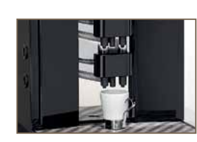
Height-adjustable spout The spout is easily adjustable to enable cups from 59 to 169 mm tall to be filled.