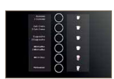
Variable number of drink buttons programmed for coffee specialities. Second-level drinks are triggered with a double-click.