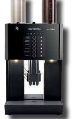
Equipped with one grinder and a topping container