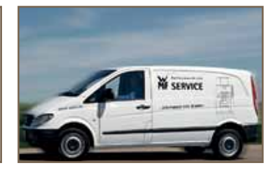
WMF covers more than 70 countries with trained service engineers.

professional@wmf.de \cdot www.wmf.com 3074 # 63 3038 0391 Printed in Germany 03.12