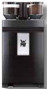
WMF 1500 S rear view