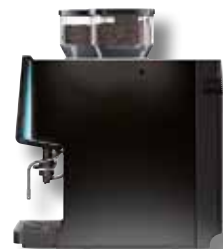
WMF 1500 S side view