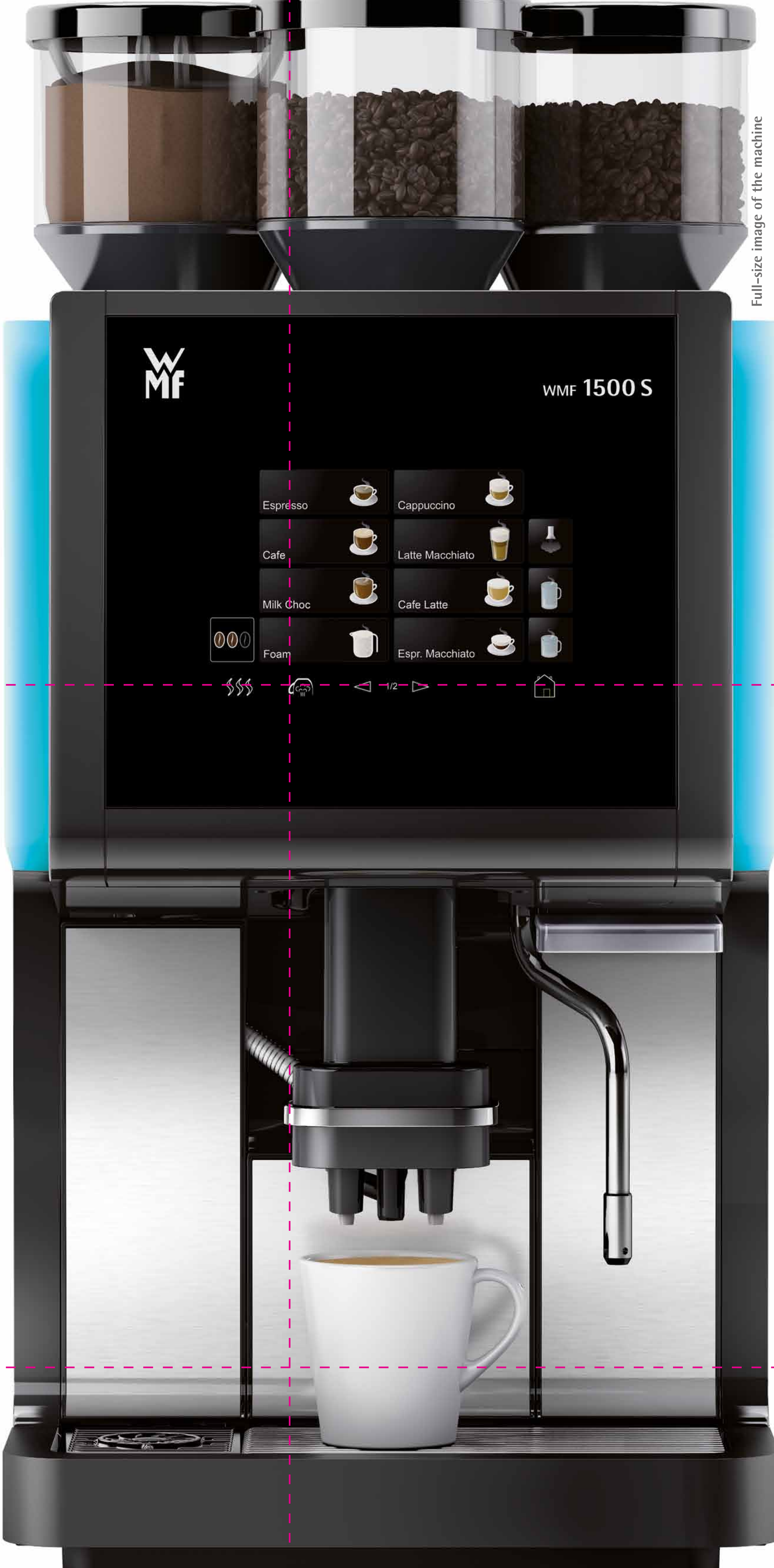
Full-size image of the machine

Environmentally friendly thanks to "Green WMF" Reduced energy consumption, reduced use of chemicals, and almost 100% recycling – these are just a few of the points in the sustainable WMF concept.